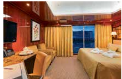
Deluxe Balcony Suite